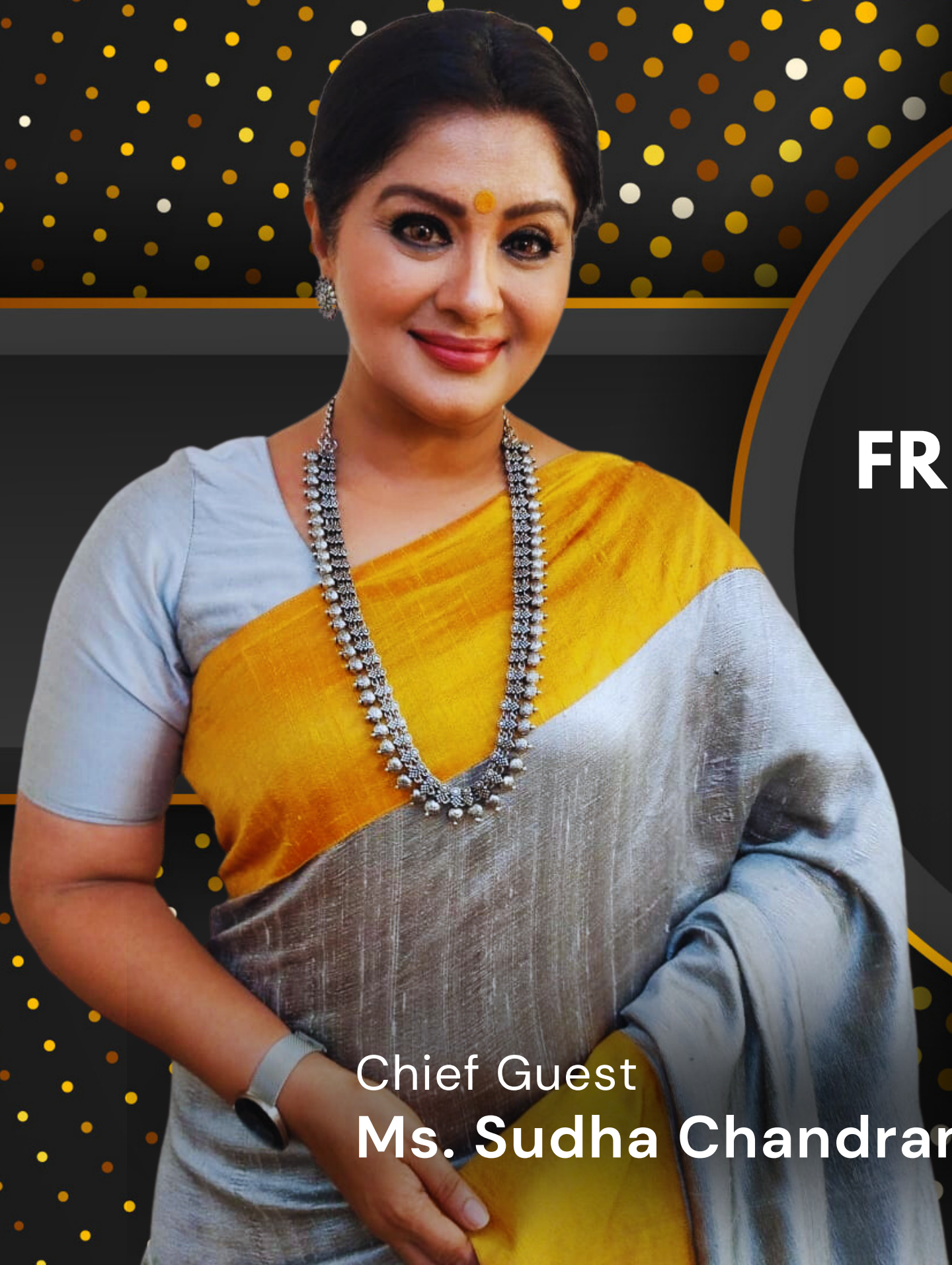
Chief Guest Ms. Sudha Chandran